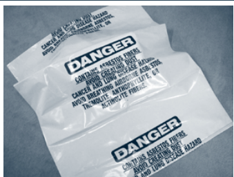
Asbestos Waste Disposal Bag