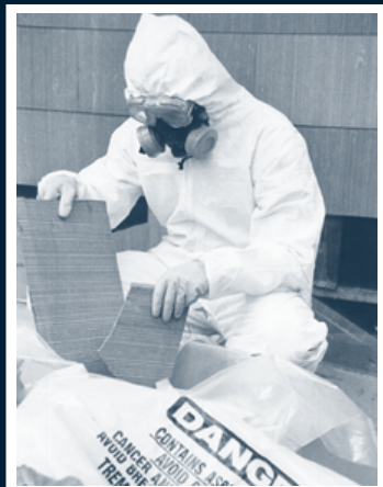
Placing Debris into Cardboard Boxes