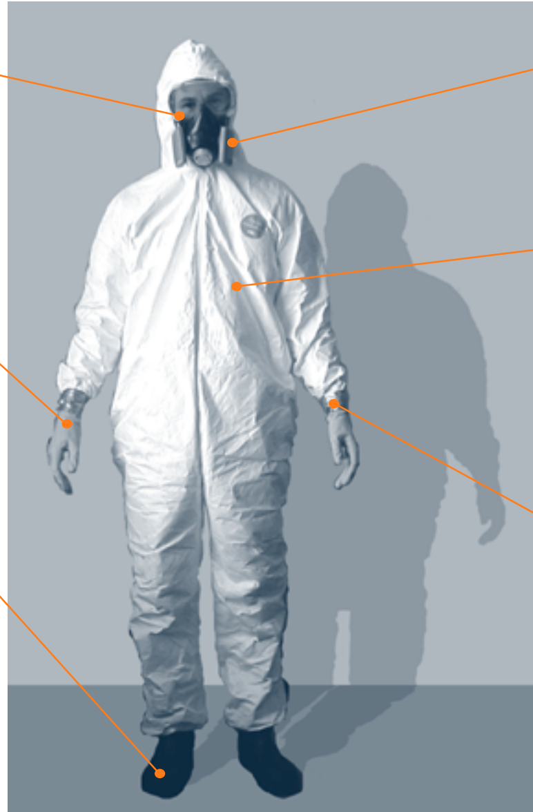
Person in proper protective clothing