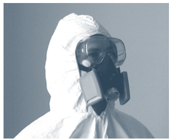
Proper Face Gear

During removal, all workers must be protected from breathing or spreading asbestos fibers by wearing an appropriate respirator, disposable coveralls, goggles, disposable gloves, and rubber boots.